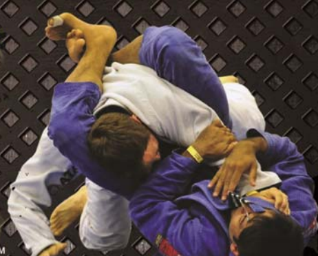
-THE OLDEST AND MOST ESTABLISHED BJJ & GRAPPLING TOURNAMENT IN PENNSYLVANIA