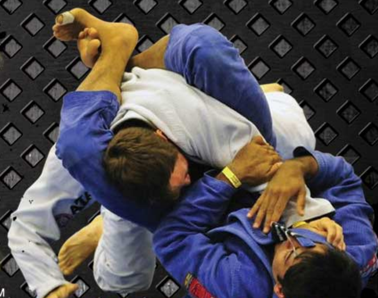
-THE OLDEST AND MOST ESTABLISHED BJJ & GRAPPLING TOURNAMENT IN PENNSYLVANIA